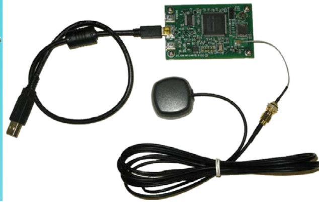
GPS Clock and Synchronized TRNG